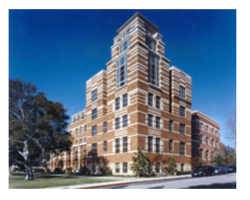
Law Library Tower