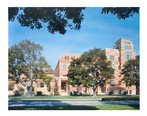
UCLA School of Law