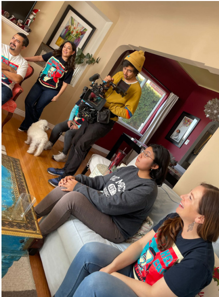
CRS alumni and members of the Bring Eyvin Home Coalition being filmed for a documentary about Americans detained around the world.